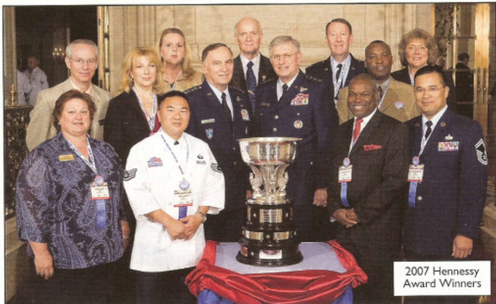
2007 Hennessy Award Winners