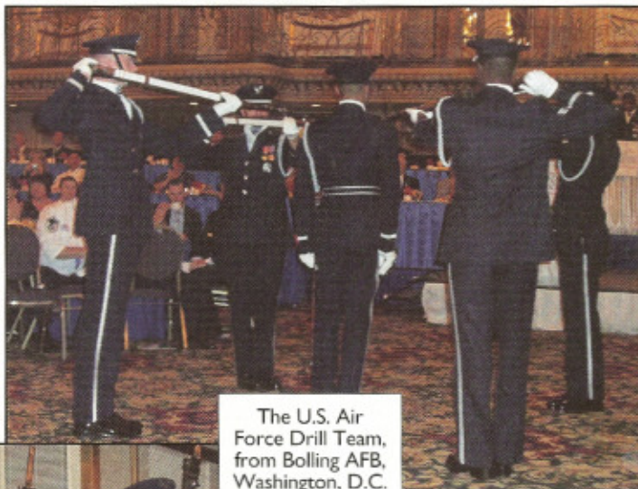
The U.S. Air Force Drill Team, from Bolling AFB, Washington, D.C.