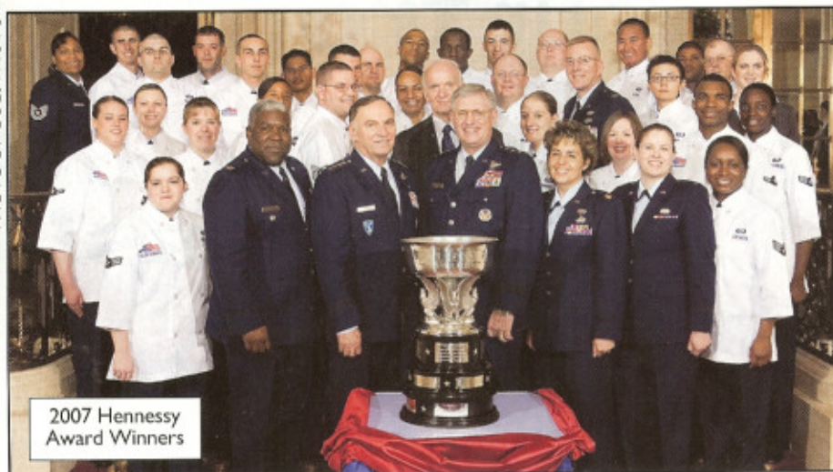
2007 Hennessy Award Winners